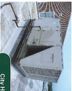
City Hall Mechanical