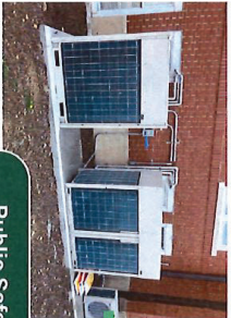
Public Safety Mechanical