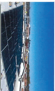
City Hall Rooftop Solar