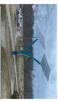
Solar Tree At Etowah River Park