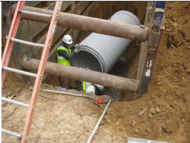
View of 36" RCP storm drain installation near MH A-1 February 18, 2015