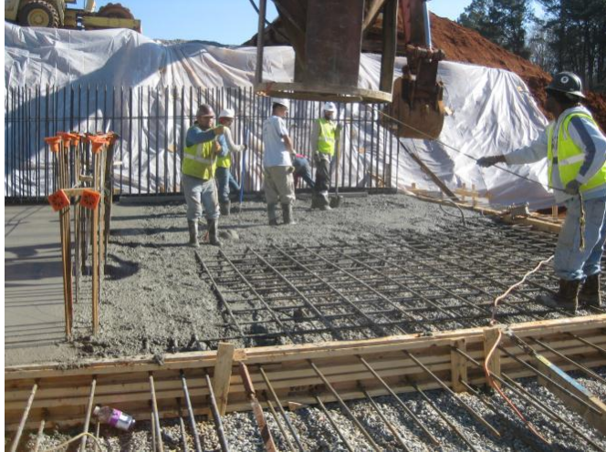
Concrete Placement for slab pour in SBR #4 February 10, 2015