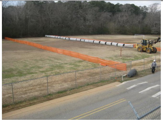
View of 36" RCP Storm Pipe on soccer field January 29, 2015