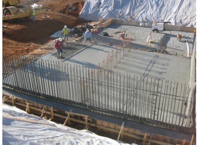
Concrete Placement for Slab Pour A in SBR #4 February 10, 2015