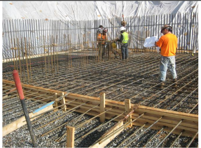
View of reinforcing steel being installed in slab February 9, 2015