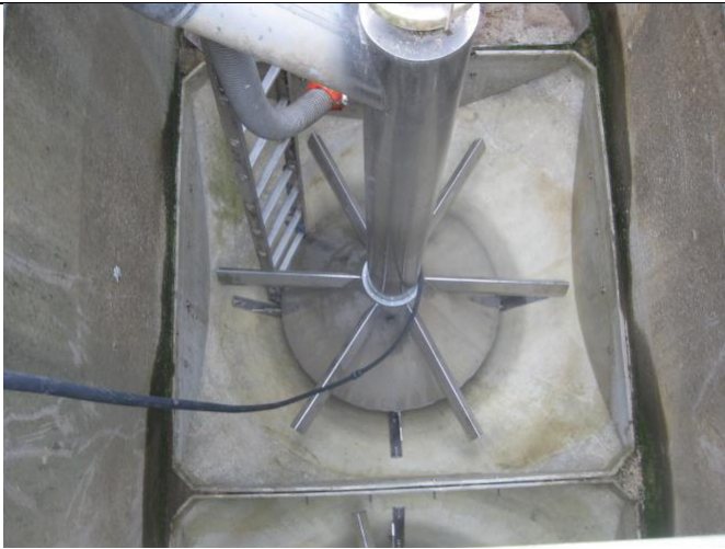
View of Filter Cell #8 being cleaned. January 15, 2015