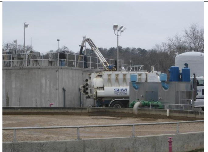
View of sand removal from filter #7 February 17, 2015